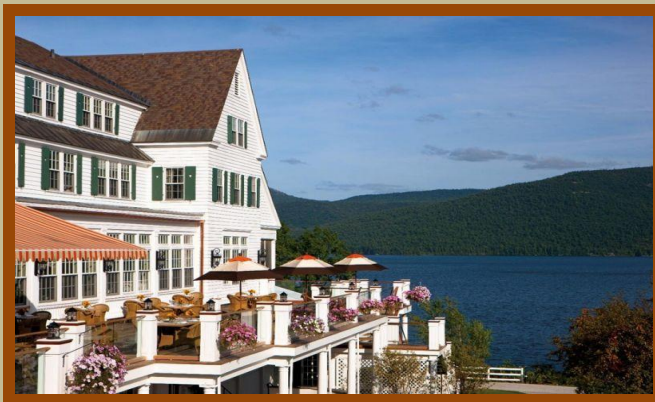
Shelving Rock Terrace

9-12:30 PM Conference Sessions [ Dollar Island West]