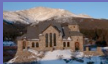
SAINT MALO RETREAT CENTER, ALLENSPARK, CO